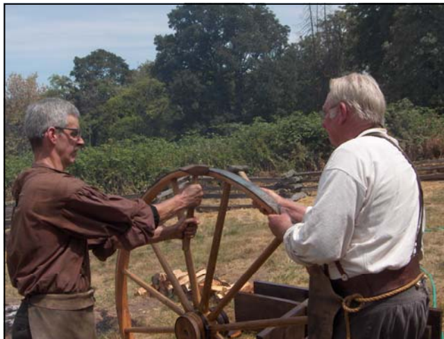
Banding a wheel is a 19th century skill brought to life at Champoeg during Living History Saturdays.