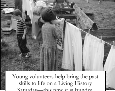
Young volunteers help bring the past skills to life on a Living History Saturday—this time it is laundry.